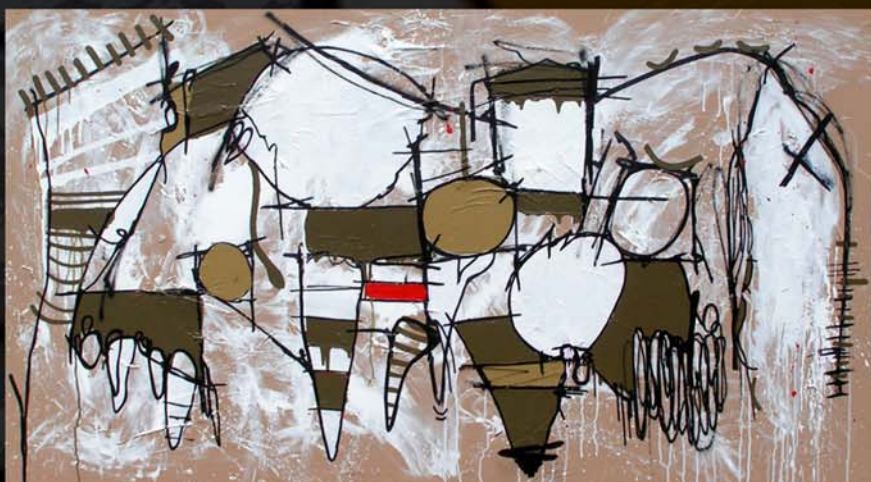
Em cinco pés 2008, 100 x 181 cm