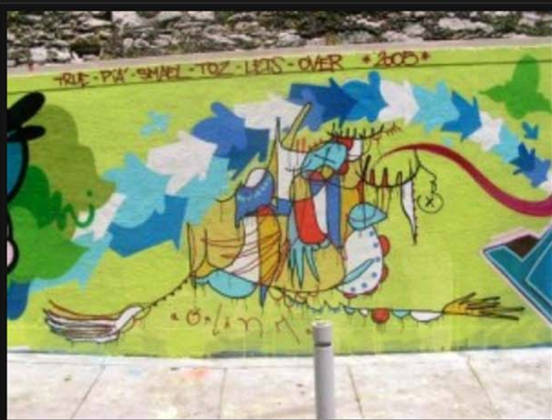
A Galinha (The Chicken), a collaborative street piece by Smael and other artists, 2005, photo by Smael Vagner.

street art and an upcoming clothing line.