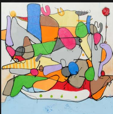
Cuando o sol se for na Marambaia 2010, 130 x 130 cm

More information on the artist can be found at www.smael.com.br .