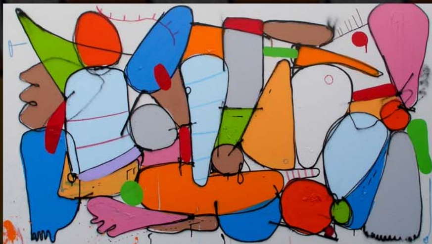
O Leao 2010, 90 x 160 cm